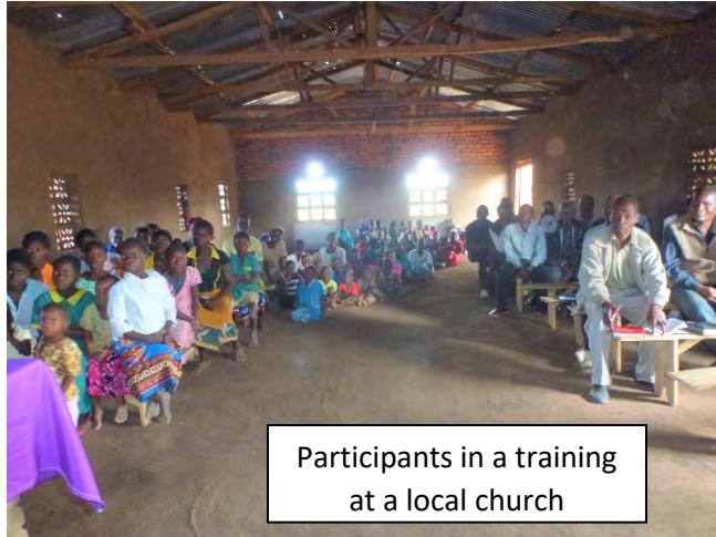
Participants in a training at a local church

Without re-iterating the needs as communicated to us in more detail as I did in my previous newsletter, we found many of the same situations and needs in the South as we did in the North.