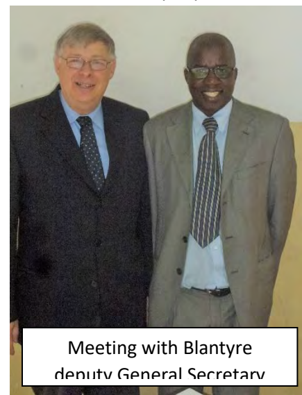
Meeting with Blantyre deputy General Secretary

We also met with the deputy general secretary of the Blantyre CCAP Synod. At the present time Leadership in the church is being discussed at the synodical levels and a great concern is voiced about current trends. In the next week meetings will be held and it was felt that our meeting with the deputy general secretary is more than just coincidence. They were looking at sending a couple of pastors to attend the seminar on Servant Leadership June 12 - 16 to observe and learn.